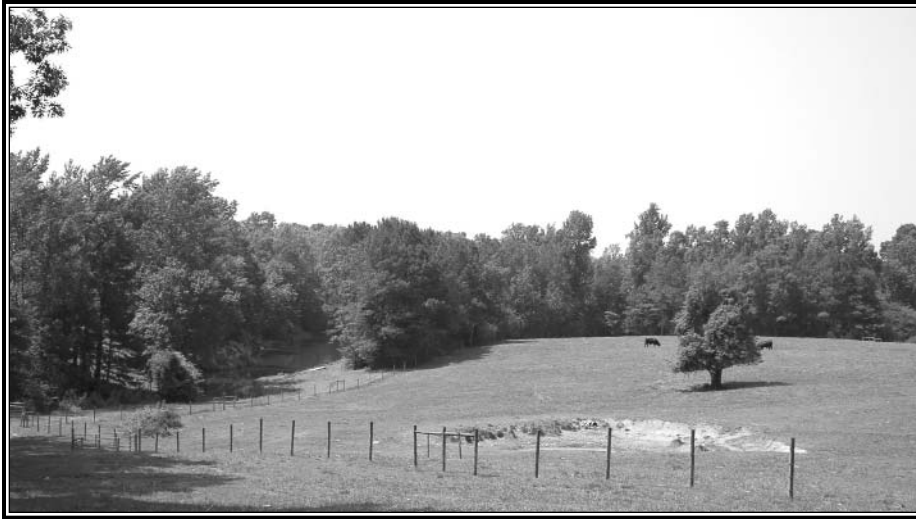
Sam Mitchell Farm in Oconee County