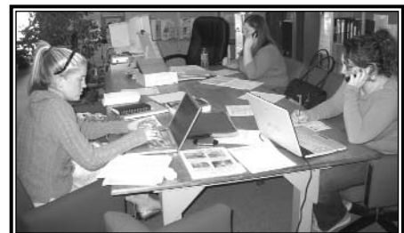
Interns hard at work in the land trust office.