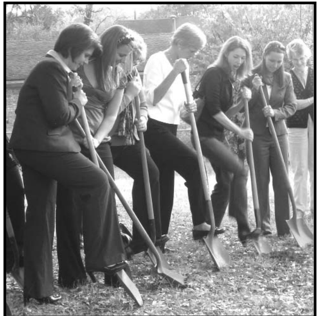
The steering committee for the ALT/Habitat WomenBuild breaks ground at 883 Waddell Street.

A ground breaking was held for the home at 883 Waddell Street on November 14th.