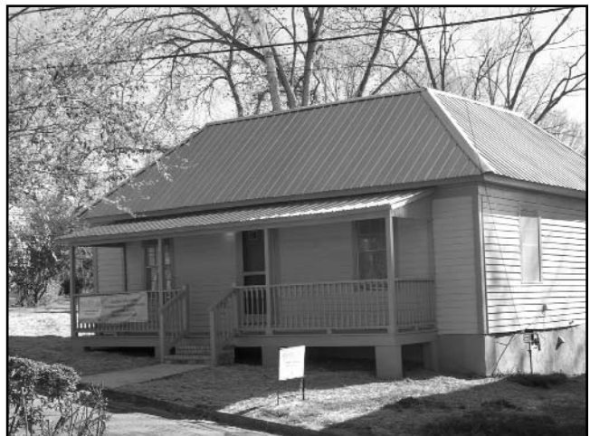
861 Waddell after rehab