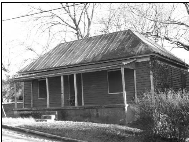
861 Waddell, “Mustard,” before rehab