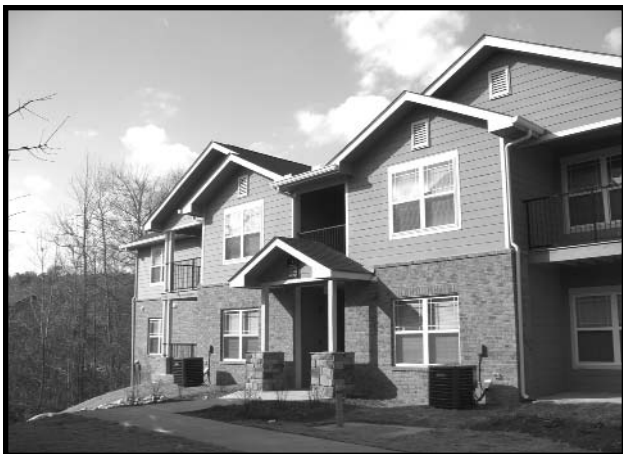
After 11 months of construction, Fourth Street Village is close to completion. This building is ready for occupants.