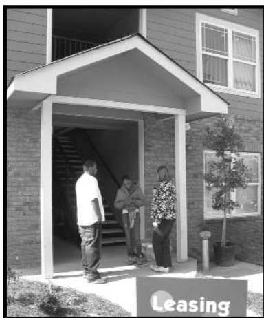
Fourth Street Village.

while the remaining buildings will be finished in a few weeks. Fourth Street Village will provide 94 apartments for residents making less than 50% of Area Median income, or $24,400 for a family of 3. ALT worked with Ambling Development Partners and Ambling Construction to build the units. The project received funding from