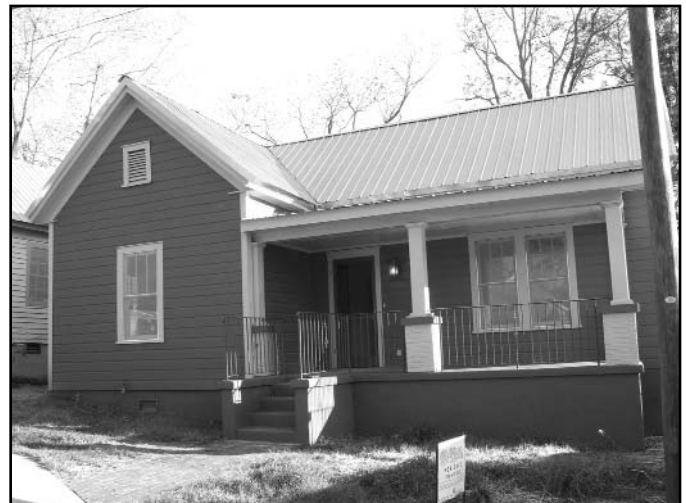
865 Waddell, "Ketchup," before rehab (above) and restored to its former glory (right). Photos of the interior (above) show the condition before rehab, during construction and once finished.