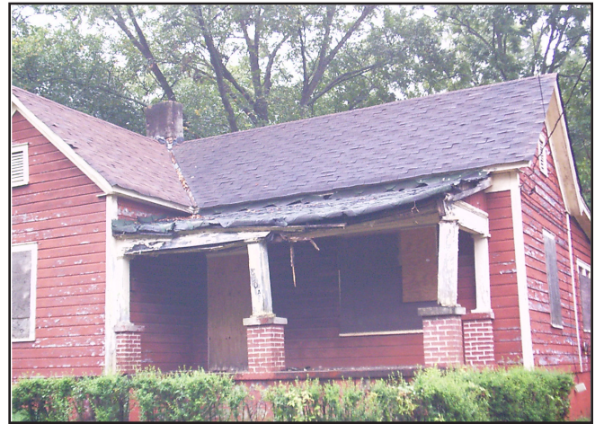
Left: the completed rehabilitation of 865 Waddell. Right: the condition of the house before ALT started work.