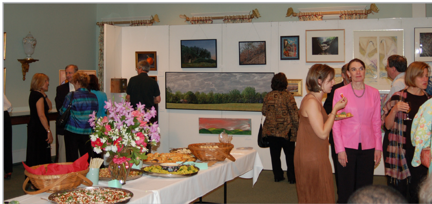
Attendees enjoy the beautiful artwork, flowers, and delicious food at the third Spirit of the Land.

Many thanks to all the artists and donors who made this year another success! Please see the columns below for a complete list of these generous community members. Special thanks also to the State Botanical Garden of Georgia for the beautiful venue and exhibit space.