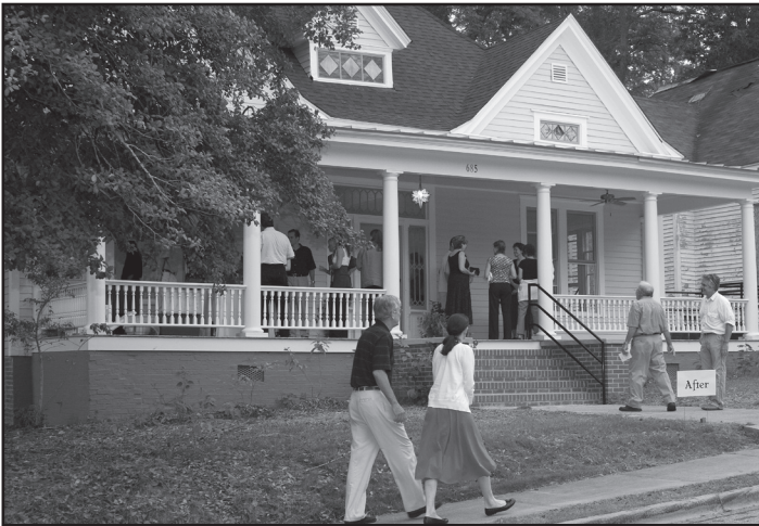
685 North Pope Street, ALT's new home.