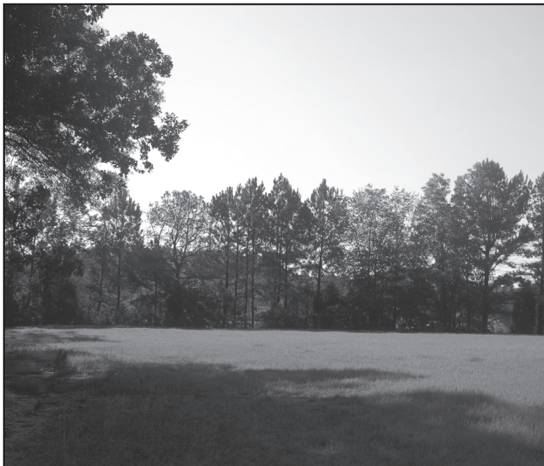
Glynfield Park in Henry County.