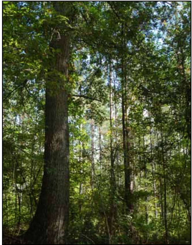
The Burdett property in Wilkes County.

As a member of the Athens-Clarke County Greenspace User Group, ALT helps make recommendations to the county about greenspace acquisition using SPLOST 2005 and other funds. To date, nine parcels protecting farmland and river frontage have been acquired. Because ALT submitted the original SPLOST 2005 greenspace acquisition funding proposal, the user group asked ALT to sponsor a SPLOST 2011 proposal for continuation of