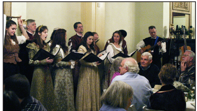
Choral Entertainment at the Renaissance Dinner