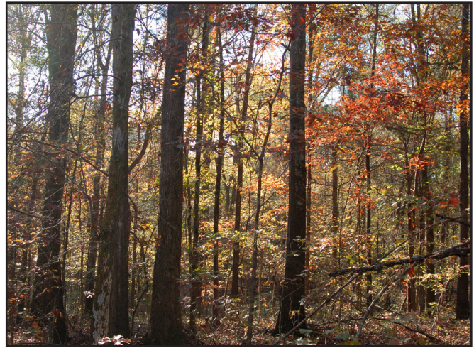
ALT's new conservation easement in Franklin County.

Our protected forests, wetlands and pastures provide many ecosystem services that are enjoyed by the entire community. The calculations were based on an assessment of the ecological characteristics of the protected land and monetary values transferred from relevant economic studies such as UGA's.