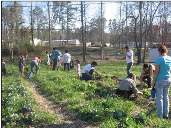
Members of the Pinewoods Community Garden prepare beds for spring planting.