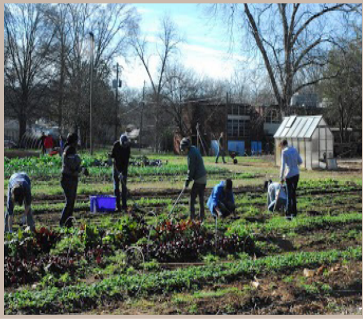
Volunteers at West Broad Garden on Dr. Martin Luther King, Jr. Day