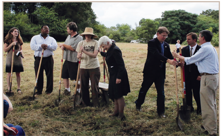
Williams Farm Groundbreaking

During 2013, the West Broad Market Garden grew food for a group of people who paid up-front for a weekly share of the harvest. Many participants paid extra so that ALT could sell produce at half price for low-income residents.