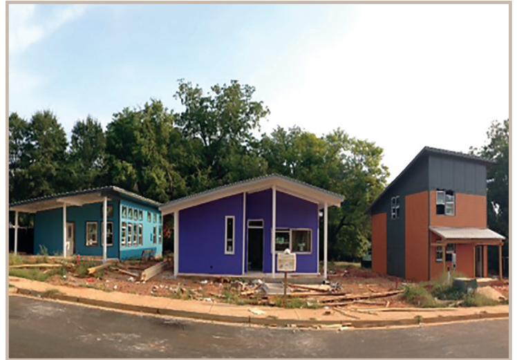
The first phase of Cottages at Cannontown under construction