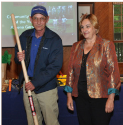
Community Garden of the Year Award was presented to Athena Gardens