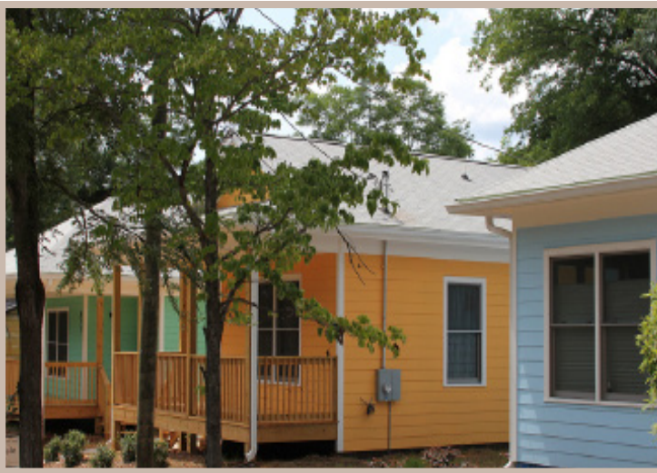
Three new EarthCraft homes on Waddell Street

ALT also purchased five recently-constructed 3- and 4-bedroom houses on Bray Street, just outside of our Cottages at Cannontown neighborhood. The former student homes had been foreclosed on and were sold to ALT by First American Bank. In addition, ALT purchased a home and 2.1 acres on Ruth Street where we plan to build additional housing. This tract is across the street from the Williams Farm.