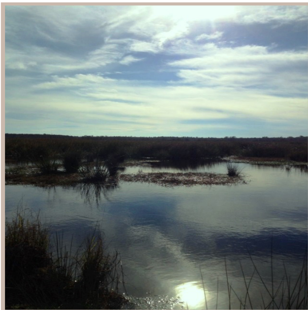
483.5 acres of wetlands for recreation along the Satilla River in Camden County

During 2014, ALT's Conservation Program worked with landowners of three properties to protect 1,983 acres, preserving land in Camden and Hancock counties, including 483.5 acres of freshwater wetlands along 1.2 miles of the Satilla river in Camden County. ALT now holds 13,505 acres in conservation easements in a total of 26 counties. In August, ALT earned renewed accreditation from the Land Trust Accreditation Commission, an independent program of the Land Trust Alliance. This was a huge benchmark and achievement for ALT. From the beginning, ALT has used the Land Trust Alliance's standards and practices to guide our land conservation work. Remaining accredited is critical for our growth and confirms that we are continuing to meet the highest ethical standards in the field of land conservation as well as in our affordable housing and community agriculture programs.