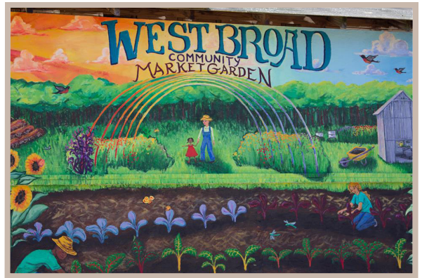
Mural at the West Broad Market Garden

In 2014, Athens Land Trust celebrated its 20th Anniversary and the West Broad Farmers Market (WBFM) transitioned from a monthly market to a weekly market, operating every Saturday from May through December. The Market continues to increase community access to affordable, healthy food and provides an outlet for local farmers and entrepreneurs to sell their products. Cooking demonstrations, health screenings, and educational programs related to sustainable farming methods are regularly offered at the Market, which is situated in one of Athens' most food-insecure neighborhoods.