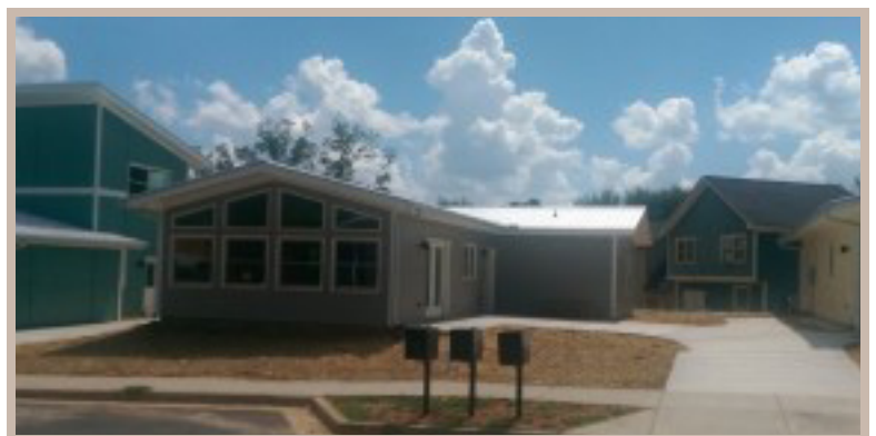
One of the completed Eco Cottages at Cannontown

ALT's Affordable Housing Program completed construction of the Eco Cottages at Cannontown in 2014, a project which helped ALT earn the EarthCraft Builder of the Year Award in October. This award, presented by the Southface and the Greater Atlanta Home Builders Association, promotes energy efficient, healthy, comfortable, and durable new construction and renovation. ALT was honored for leadership and excellence in green building design and construction.