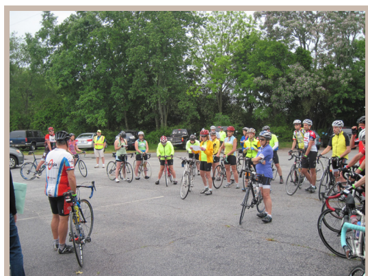
Cyclists gather at the beginning of the route