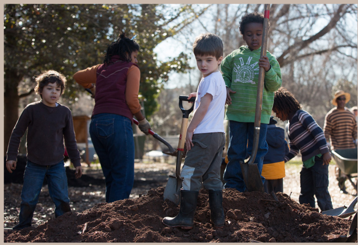
Community members at West Broad Garden on MLK Day of Service 2014

The West Broad Market Garden hosted a Dr. Martin Luther King, Jr. Workday and Celebration. Over 75 participants, including community members, members of the Boys and Girls Club, and youth from Classic City High School helped with composting, built raised beds, prepped trees for planting and assisted with hoop house activities. ALT also hosted volunteers at the Williams Farm, where over 30 people of all ages assisted in clearing the fence line. A third site was at Hill Chapel Baptist Church where about 30 volunteers helped to establish trails. Thank you to everyone who came out!