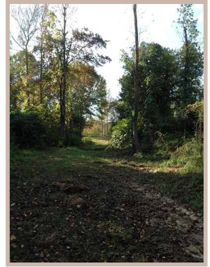
Winder, Barrow County