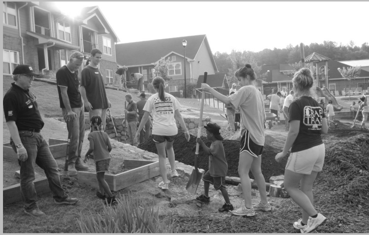
Volunteers from Caterpillar, UGA and Fourth Street residents work together to build a community garden

Thanks to employees from Caterpillar, the residents at Fourth Street Village apartments are enjoying fresh vegetables and beautiful flowers! Several employees from Caterpillar Inc. volunteered their time and brought equipment to build raised garden beds and walkways with materials and compost generously donated by Related Recycling and Supply. Over 50 volunteers and residents came together to build the community garden. Fourth Street Village is home to more than 289 people who benefit from affordable rental housing provided by Athens Land Trust (ALT) and our partners.