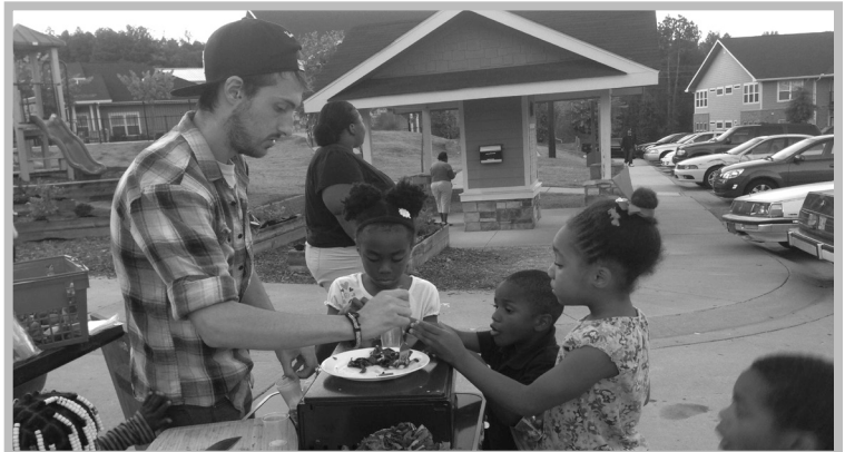
Fourth Street residents enjoy tasty, fresh & nutritious produce

289 low-income residents 96 affordable units, 24 market-rate units