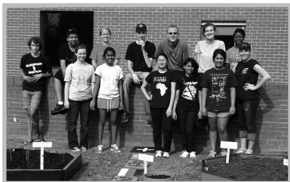
The Math Garden at Whit Davis Elementary