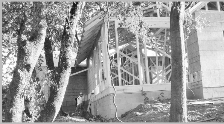
Two EarthCraft Homes under construction on Old Winterville Road

Two new EarthCraft homes are under construction on Old Winterville Road and are going up quickly. The homes were designed by Chris Evans of E+ E Architecture and are being built by contractor Chessser-Kennedy. Both homes are being built to universal design specifications, which seek to attain functionality and accessibility for people of all abilities and to accommodate the owner through all stages of life.