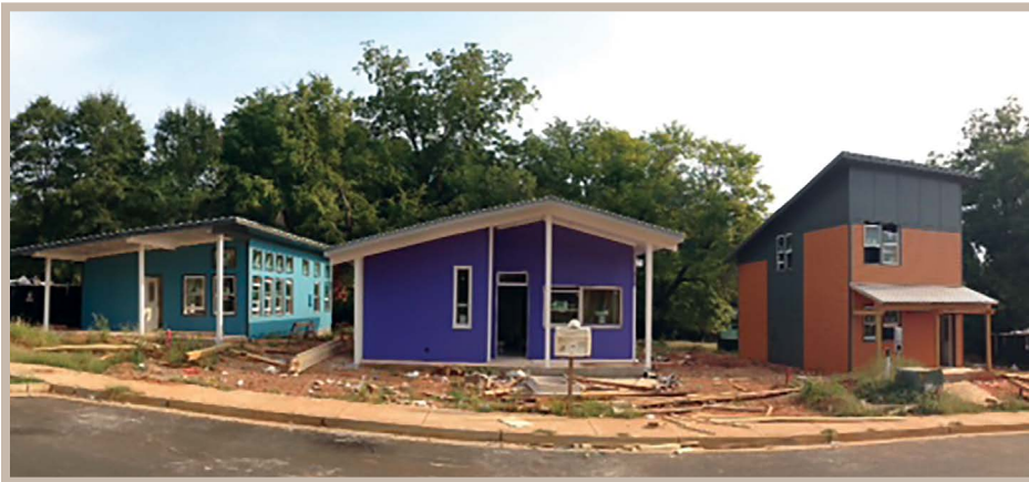
Three of the Cottages at Cannontown are under construction.