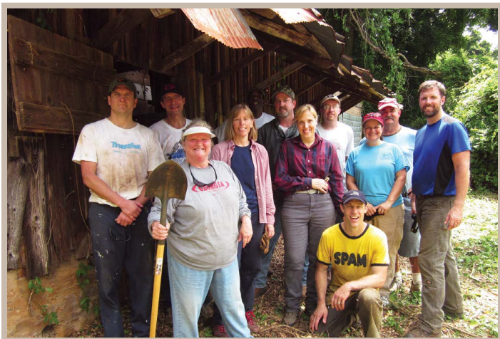
UGA staff members volunteer at the Williams Farm.

ALT received an Environmental Justice grant of $29,700 from the Environmental Protection Agency for the Community Agriculture Program. The grant will support educational activities at the West Broad Market Garden that include gardening and nutrition education for children who attend the nearby Boys & Girls Club, workshops for neighborhood residents in sustainable agriculture, and a community composting program. ALT was one of only four organizations in the Southeast to receive a grant.