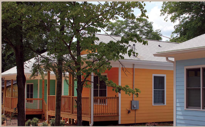
Three new EarthCraft homes on Waddell Street were completed in June.