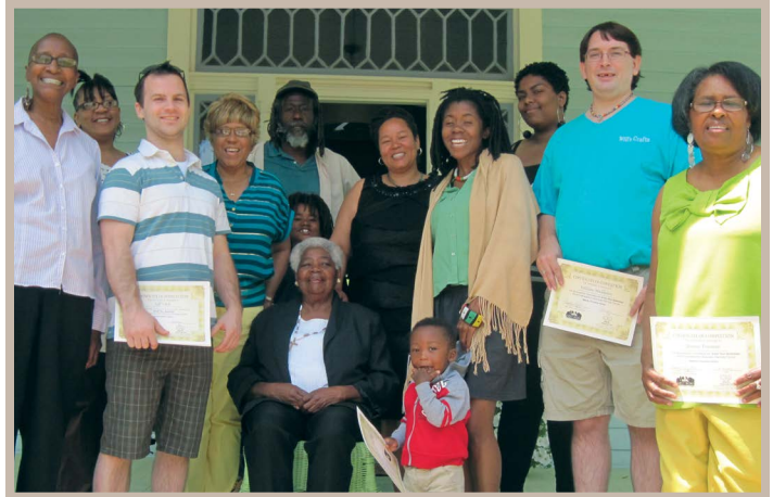
12 vendors completed an eight-week business development training course.