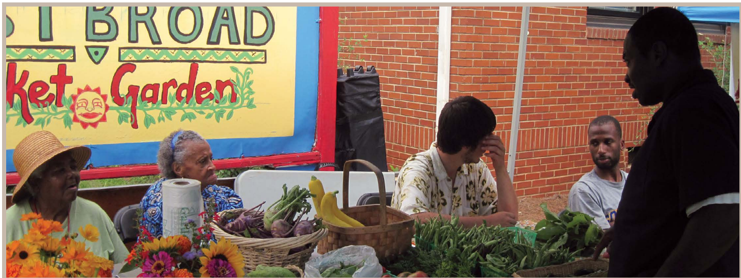
Local fresh produce from the West Broad Market Garden is sold every Tuesday afternoon.