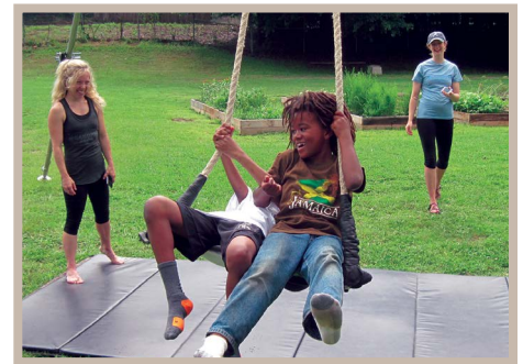
Children's activities with Canopy Studio

The Market features 23 vendors that include farmers with fresh produce, artisans, bakers, and makers of many delicious foods. Each Market also has cooking demonstrations, health screenings, educational programs, music, and children's activities, including a Next Top Chef competition where children make healthy snacks and compete to win bikes donated by Bike Athens. One of the educational