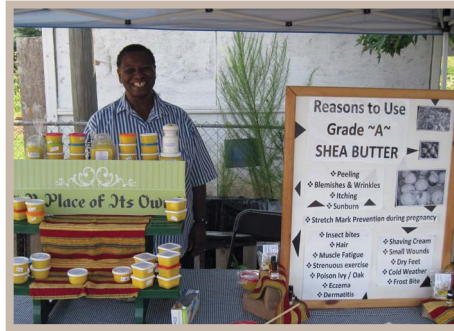
A vendor of natural products at the Market

programs now held at the monthly Markets is the sustainable agriculture workshop series hosted by the Community Garden Network.