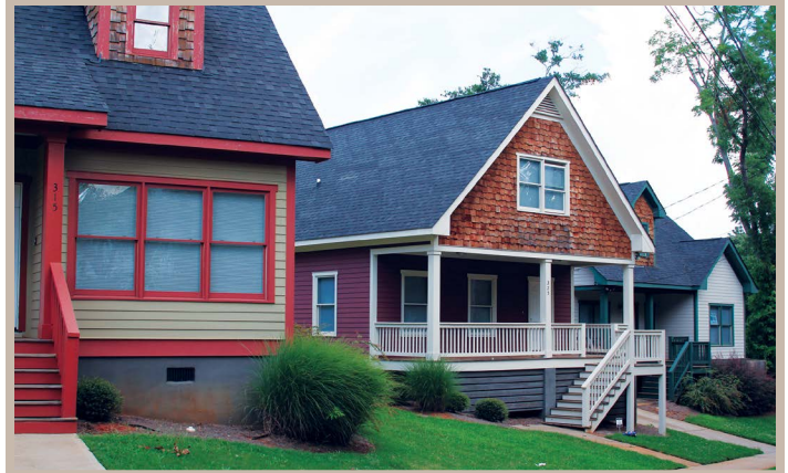
ALT recently purchased five houses on Bray Street.