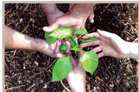
The Care Garden at AIDS Athens