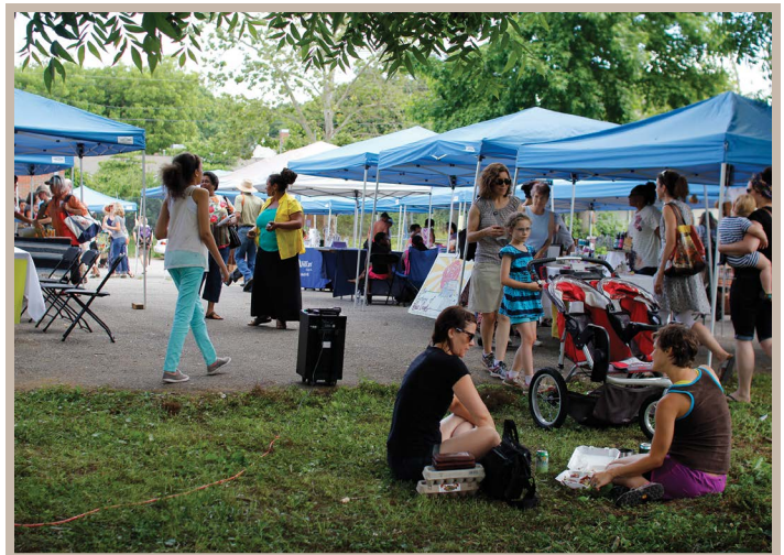
Customers enjoy the West Broad Farmers Market.

The West Broad Farmers Market opened its gates on Saturday, May 4th, and was a great success despite heavy rains. The subsequent Markets of June, July, August, and September have also been enjoyed by both adults and children. The Market is open on the first Saturday from 10 a.m. to 1 p.m. at the West Broad Market Garden, ALT's urban farm, and customers can visit the garden while they shop for fresh vegetables, delicious foods, baked goods, and wonderful handmade crafts, all from local farmers and vendors! The Market also features cooking demonstrations, nutrition education, and children's activities. Read more on pages 2-5.