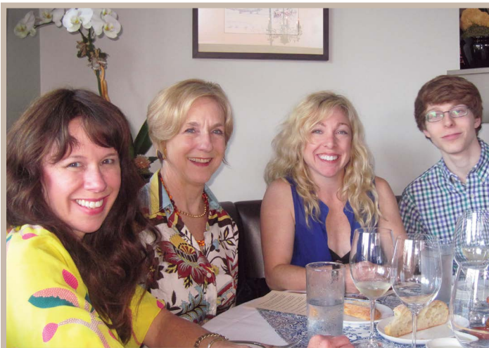
Guests enjoy the Double Dollars Fundraiser at The National on May 4th.