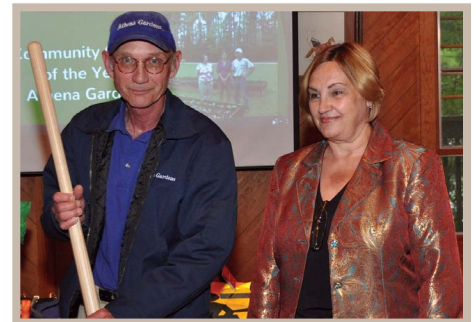
Community Garden of the Year Award was presented to Athena Gardens.