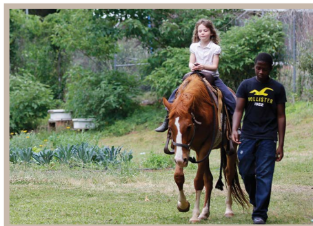
Horseback rides at the West Broad Farmers Market