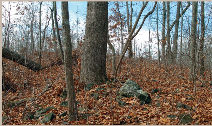
152 acres of Civil War battlefields and mature oak-hickory sloped forest are now protected with a conservation easement.