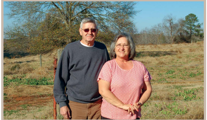
42 acres of the Shelnett family farm have been protected with a conservation easement. The farm has been in their family since 1892.