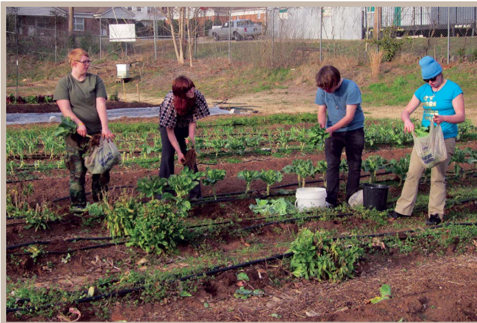
YUF students harvest produce at the West Broad Market Garden.