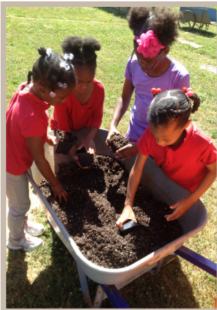
Students from Downtown Academy preparing to plant beans.