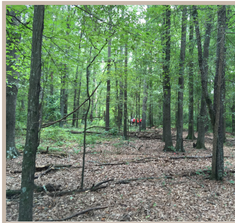
A view of the recently-cleared Five-Acre Woods, adjacent to Williams Farm off Northside Drive.