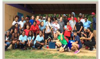
UGA Dawg Day of Service participants