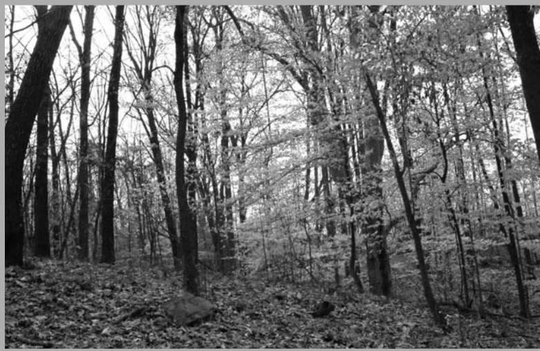
176 acres of mature forest in Athens-Clarke County

Athens Land Trust Protects 1,650 Acres of Land in 2011