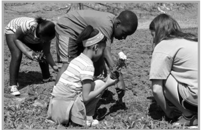
Children plant flowers at the new market garden

*See the before and after photos on page 4