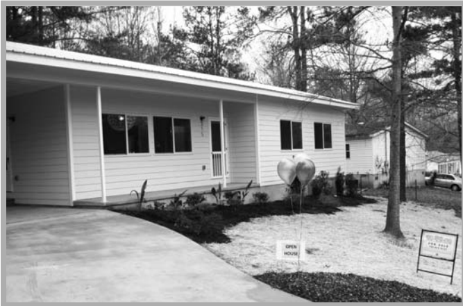
Washington Drive, AFTER