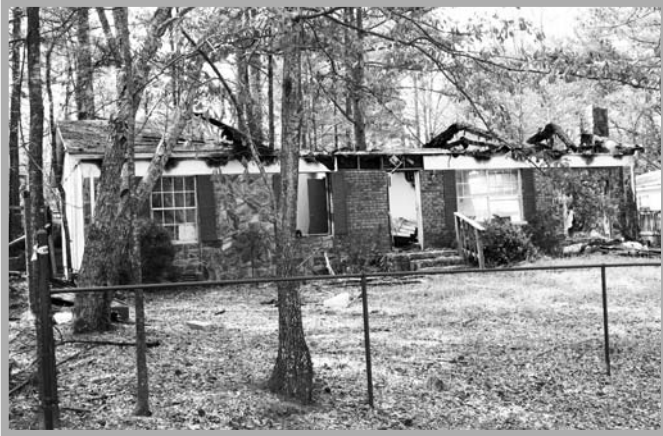
Washington Drive, BEFORE

In addition, ALT has received funding for housing development and homebuyer education from Oconee State Bank (who has supported ALT's programs for four years), Wells Fargo Foundation (who has made two previous grants), Synovus Mortgage, and First American Bank & Trust. Many thanks to the ACC Commission, HED, and our other funders for your support of affordable housing.