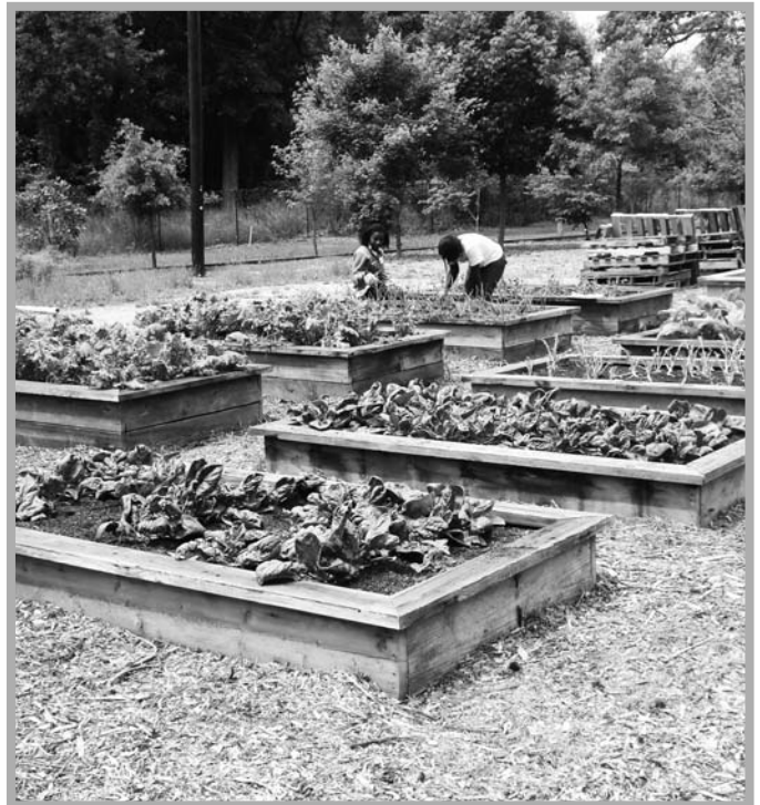
Participants working in the raised beds at the Athens Community Council on Aging Garden

A new garden was established in a vacant parking lot at the Athens Community Council on Aging, with the help of LEAD Athens, UGA Service Ambassadors, and Horticulture students. On MLK Day of Service, volunteers constructed 17 raised beds and two compost bins, and began construction of a fence. The work on the expandable fence was completed on Green Day of Service, again with the help of UGA Service Ambassadors and Horticulture students. The new garden is growing produce to be used by Meals on Wheels, Healthy Grandparents, and Campus Kitchen.