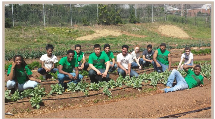
The Young Urban Farmer spring 2015 class posing at the West Broad Market Garden

The Y.U.F. have been preparing for their business presentations, which will take place on Thursday, April 30th at 6 p.m. at the Athens Community Career Academy. Students will share their experiences with the program and showcase their personal projects including mushroom logs, vermicompost, soaps, mason jar art, garden photography, birdhouses, and flower arrangements. These one-of-a-kind creations will be available for sale at the West Broad Farmers Market on opening day!