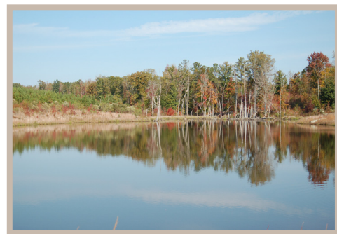
This 4.5 acre lake is part of the York-Hancock conservation easement which consists of 1484 acres of American Tree Farm.

Protected with a fee simple donation is a 15-acre tract in a commercial area of downtown Winder. This property possesses natural habitat for fish, wildlife, and plants, and includes freshwater emergent wetland and a Blue Line Stream which flows southeast through the property, emptying into the lake at Fort Yargo State Park. ALT is working on improving the site as valuable public greenspace in an otherwise developed area, sheltering small animals, migrating and resident songbirds, and providing visual relief for people in the area.