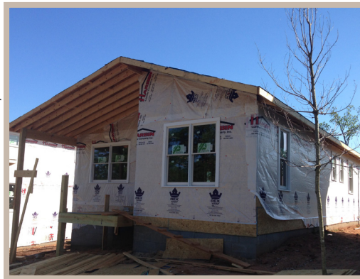
130 Cannon Drive

Construction on Phase 3 of the Cottages at Cannontown began with the new year and will consist of three new EarthCraft homes at 130, 140, and 150 Cannon Drive. Once Phase 3 is complete, there will be a total of nine homes in Athens Land Trust's North Avenue subdivision. When fully developed, there will be 15 new, permanently affordable homes. All of the new homes have