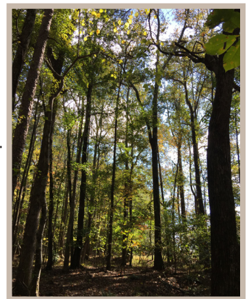
Stand of oaks and tulip poplars on Maraziti Farm