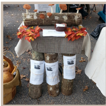
Mushroom logs on display