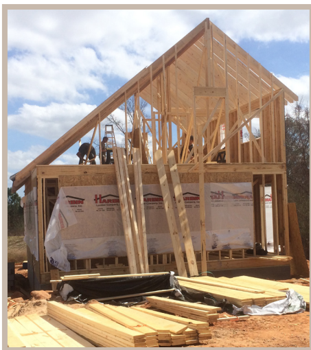
150 Cannon Drive