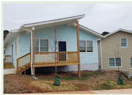
The Cottages at Cannontown.

In December of 2018, we finished the final phase of the Cottages at Cannontown, a project that began in 2013. This 15-unit EarthCraft certified subdivision is one-of-a-kind in Athens Clarke County, providing 15 families with healthy, sustainable and affordable homeownership opportunities. Construction took place in five phases, with three homes under construction at a time over the past five years.