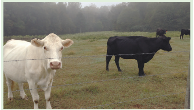
Rollins Easement in Oconee County, Georgia.

In 2018, our Conservation Program protected four Oconee County farms, or nearly 210 acres altogether, as part of the ACEP-ALE (Agricultural Conservation Easement Program-Agricultural Land Easement) program. ACEP-ALE is a voluntary program of the Natural Resources Conservation Service (NRCS) , which protects high quality agricultural lands by limiting non-agricultural uses through the purchase of development rights through conservation easements. ALT—which has been NRCS-certified since 2017, allowing us to fast-track ACEP-ALE projects—holds the conservation easements in perpetuity.