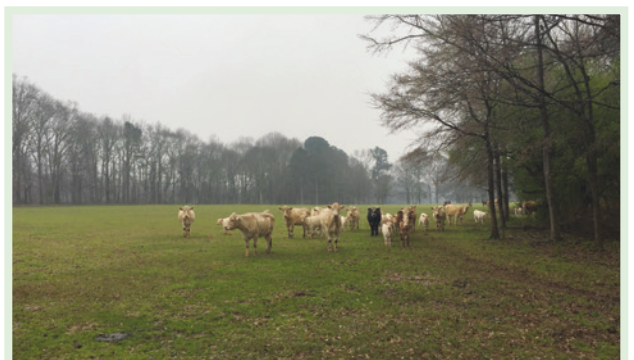
House Easement in Oconee County, Georgia.