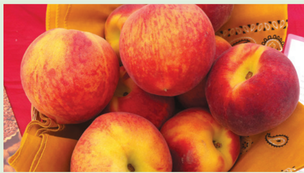
The market features fresh produce, prepared foods, and artisan goods from many talented local vendors.