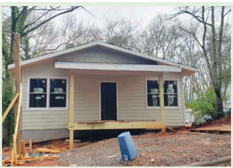
Soon-to-be affordable housing under construction at Henderson Extension!

In December of 2018, we finished the final phase of the Cottages at Cannontown, a project that began in 2013. This 15-unit EarthCraft certified subdivision is one-of-a-kind in Athens Clarke County, providing 15 families with healthy, sustainable and affordable homeownership opportunities. Construction took place in five phases, with three homes under construction at a time over the past five years.