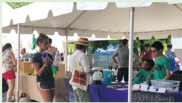
WBFM attendees enjoy a Saturday morning at the Market.