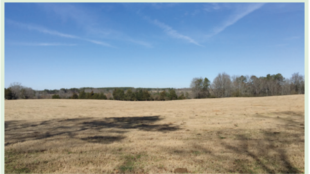
Farmington Ridge Easement in Oconee County, Georgia.

This newly protected land in Oconee County includes 60 acres of a cattle and hay farm, with natural hardwood forests, with 990 feet of a tributary to Wolf Creek. Another farm protected comprises 51.1 acres of a larger farm, also with cattle and hay pastures. The property contains 3.5 acres of non-wetland forest, used for silvopasture. A third farm property protected adds 62.5 acres to 91.5 acres already preserved for agricultural use in perpetuity. This cattle farm comprises seven acres of natural hardwood forest on the property, also used for silvopasture, and has been used for educational and research purposes. The fourth ACEP-ALE farm protected comprises more than 35 acres of a cattle and hay farm. All of these farms have high quality prime soils and soils of statewide importance. Since 2004 we have protected almost 980 acres under ACEP-ALE and its predecessor program!