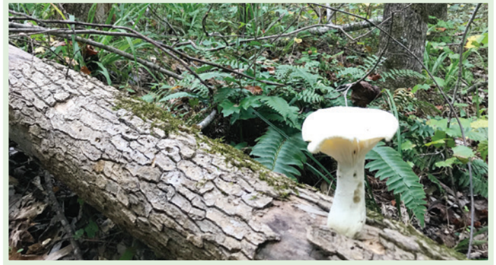
Little Sugar Creek Easement in Morgan County, Georgia.