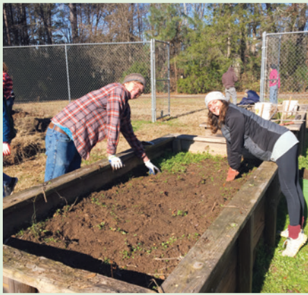
Volunteers at Athena Gardens in February.