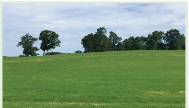
McClure Easement in Oconee County, Georgia.

Additionally, ALT worked to protect two properties in Morgan County. One project permanently protects nearly 115 acres of Oak-Hickory-Pine Forest, Bottomland Hardwood Forest, wetlands and a Blue Line Stream, as well as agricultural pastures and food plots just south of Madison. Pine management as well as agriculture and passive recreation will be allowed on the land. A further 200 acres , part of a larger farm operation, were also protected in Morgan County. This project protects 1.3 miles of Blue Line Streams and 3.4 acres of wetlands, as well as Bottomland Hardwood Forests, Mesic Hardwood Forests, Canebrakes, Granite Outcrops, Springs and Spring Runs, Oak-Hickory-Pine Forest, and Streams, with cattle pastures and managed pine.