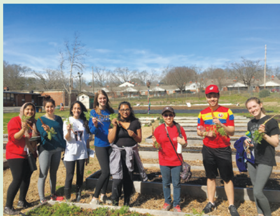
Students from UGA's IMPACT Alternative Breaks Program volunteer at the West Broad Garden.