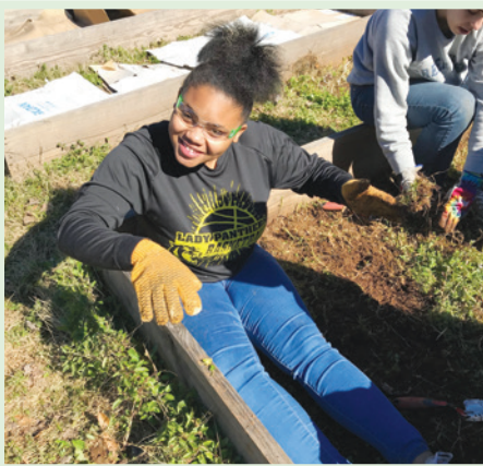
A volunteer at Mae Willie Morton Garden assists in building raised garden beds.