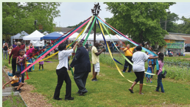
The Maypole dedication celebrates the historic West Broad School and marks the start of the market season.