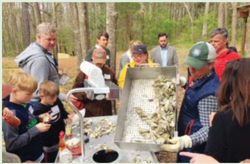
2019 attendees enjoy fresh oysters.